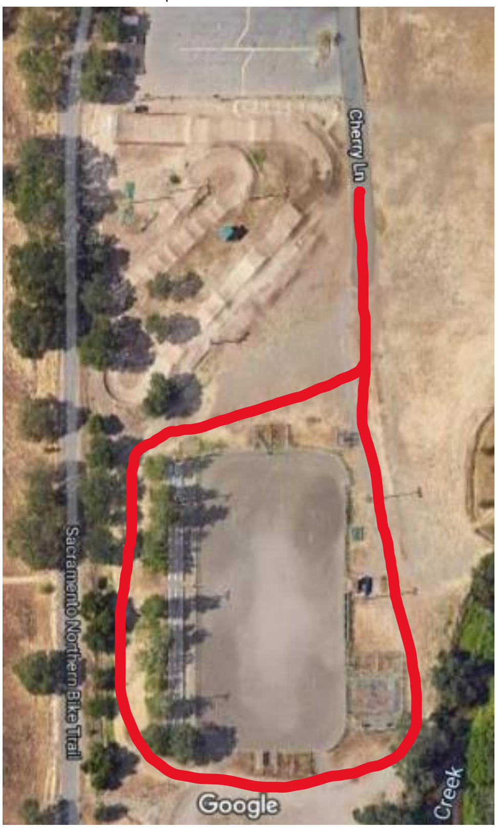
Central Park Horse Arena Fire Lane Map

as to the Fire Department with Attachment C. Fire lanes need to remain completely unobstructed and clear for the entirety of the event (Setup and Cleanup included).